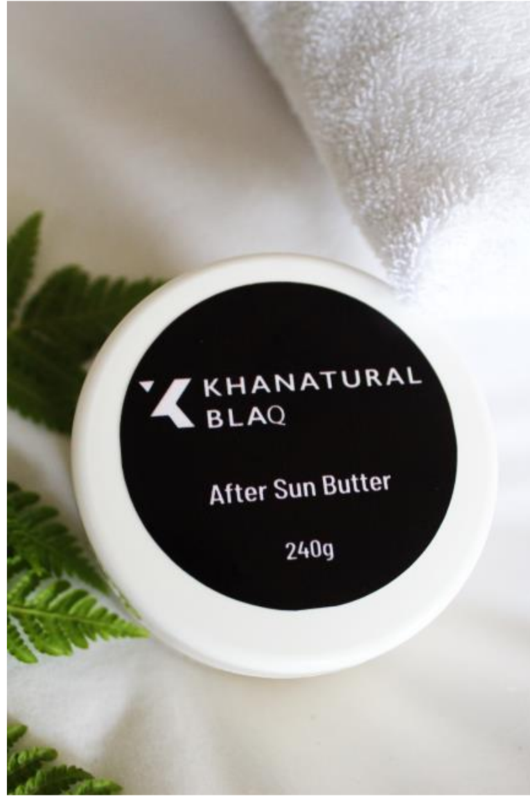
AFTER SUN BODY BUTTER 240G R420