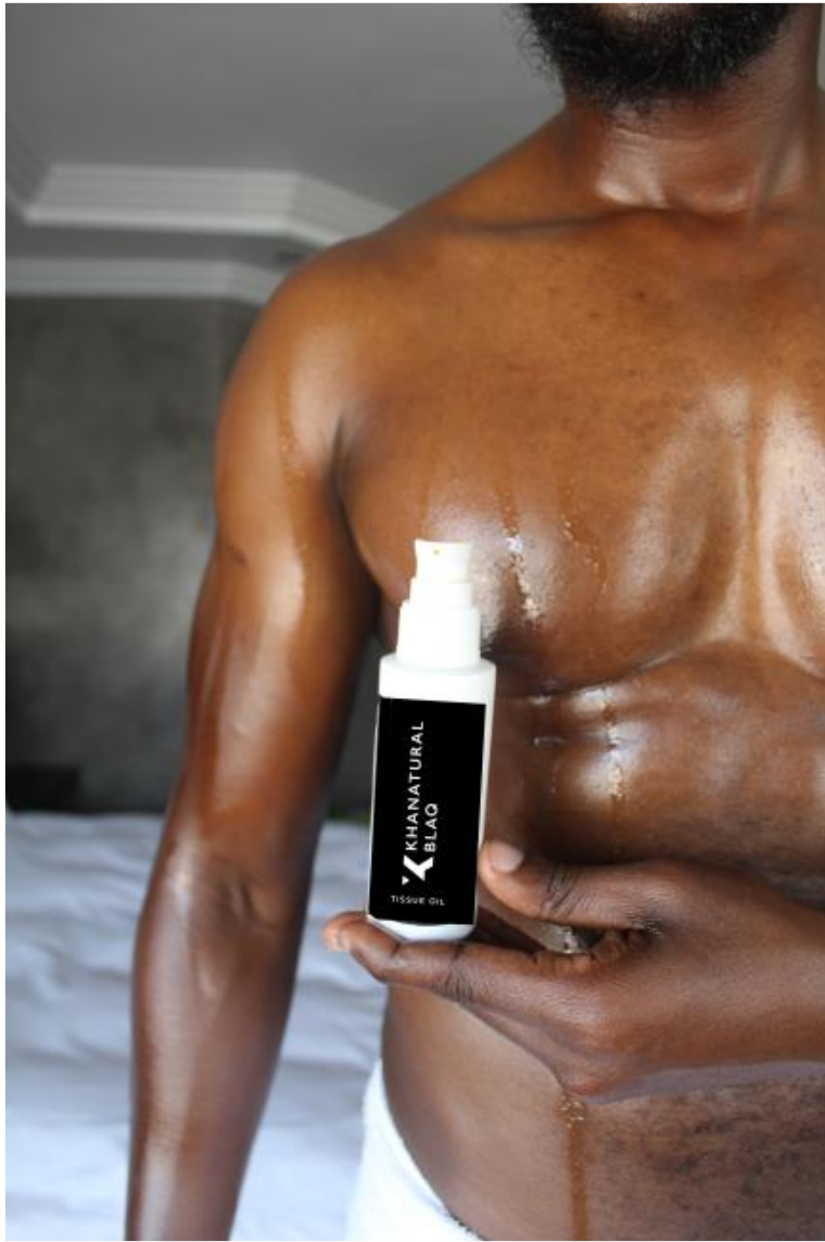
TISSUE OIL 100ML R350