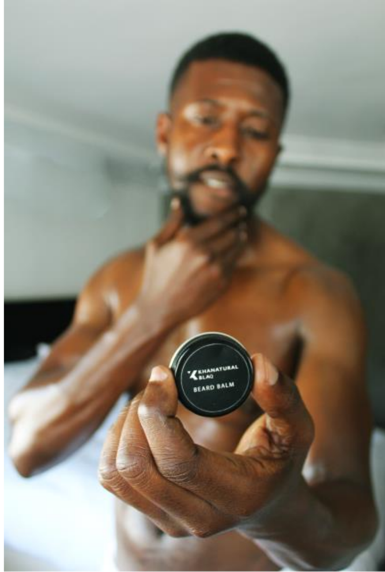
BEARD BALM 50G R300 (BIGGER IN SIZE)