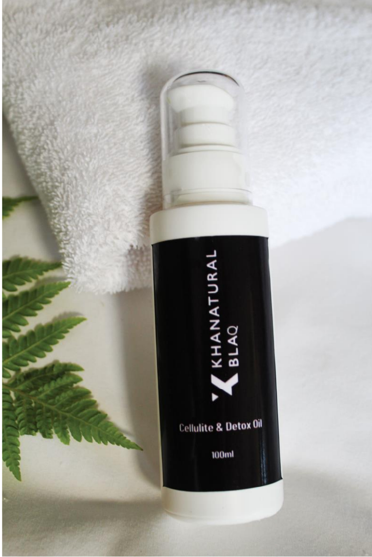
CELLULITE & DETOX OIL 100ML R300