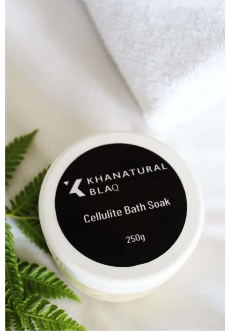
CELLULITE BATH SOAK 250G R250