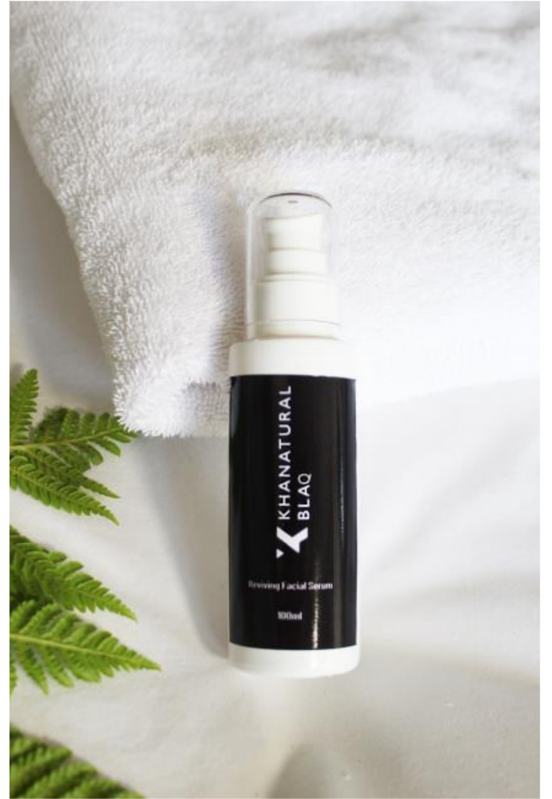
REVIVING FACIAL OIL/SERUM 100ML R550