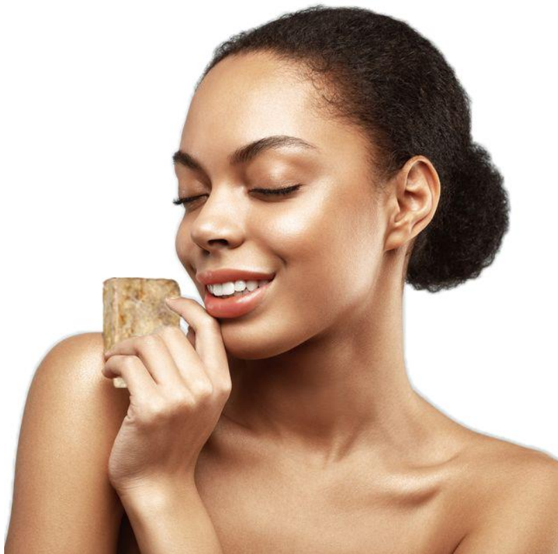
BLAQ SOAP BAR R200