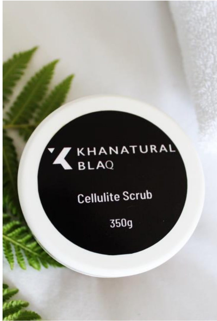
CELLULITE SCRUB 350G R350